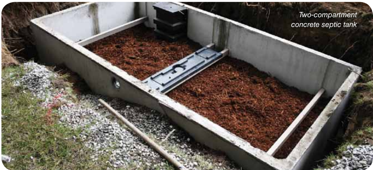
Two-compartment concrete septic tank

It is typically far less expensive to routinely inspect, maintain, and make minor repairs to a treatment system, than to neglect it and have it break down and fail abruptly.